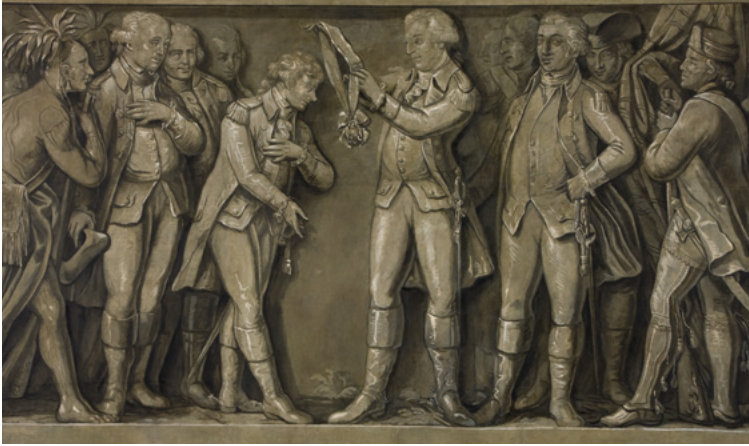
George Washington awards Kościuszko with the Order of the Cincinnati, painted by Michał Stachowicz, 1818, National Museum in Krakow