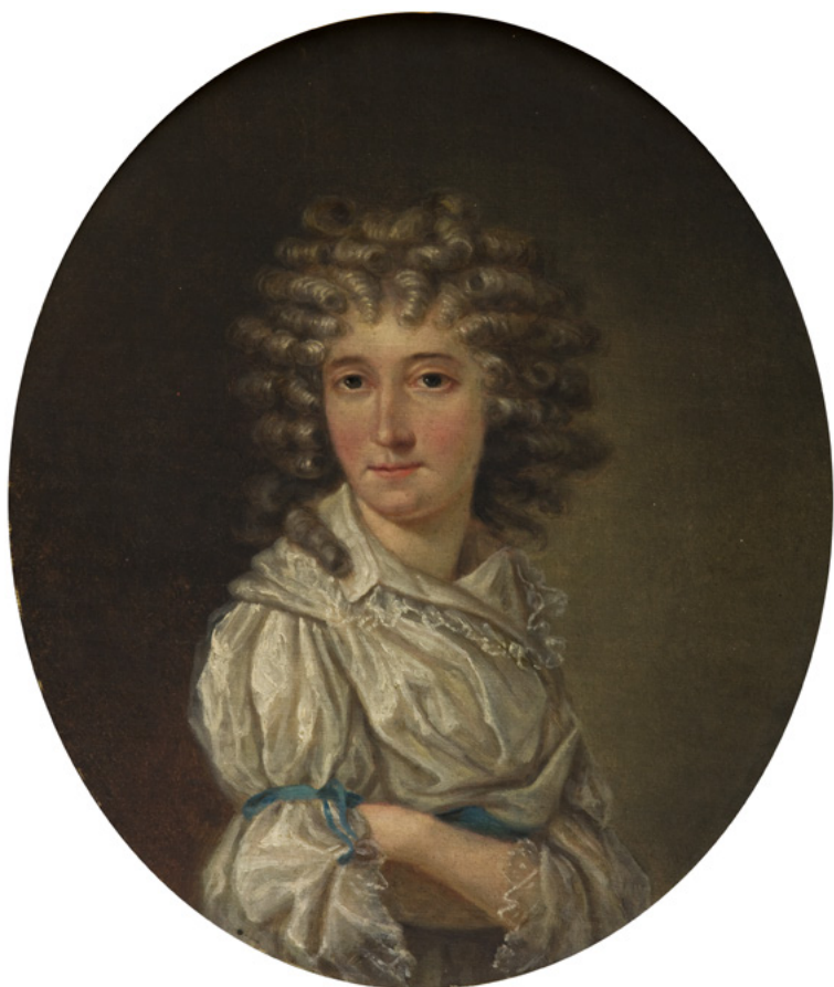
Portrait of Ludwika Sosnowska, unknown author, ca. 1775, National Museum in Krakow