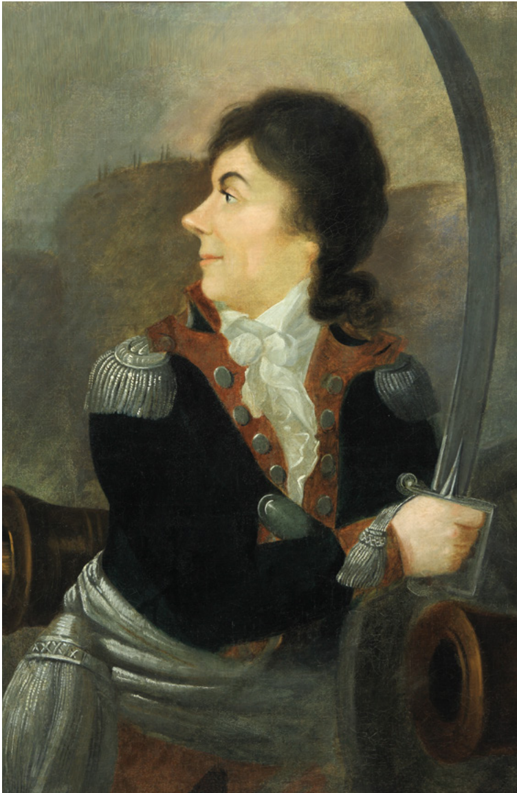
Portrait of Tadeusz Kościuszko, unknown author, ca. 1792, Polish Army Museum