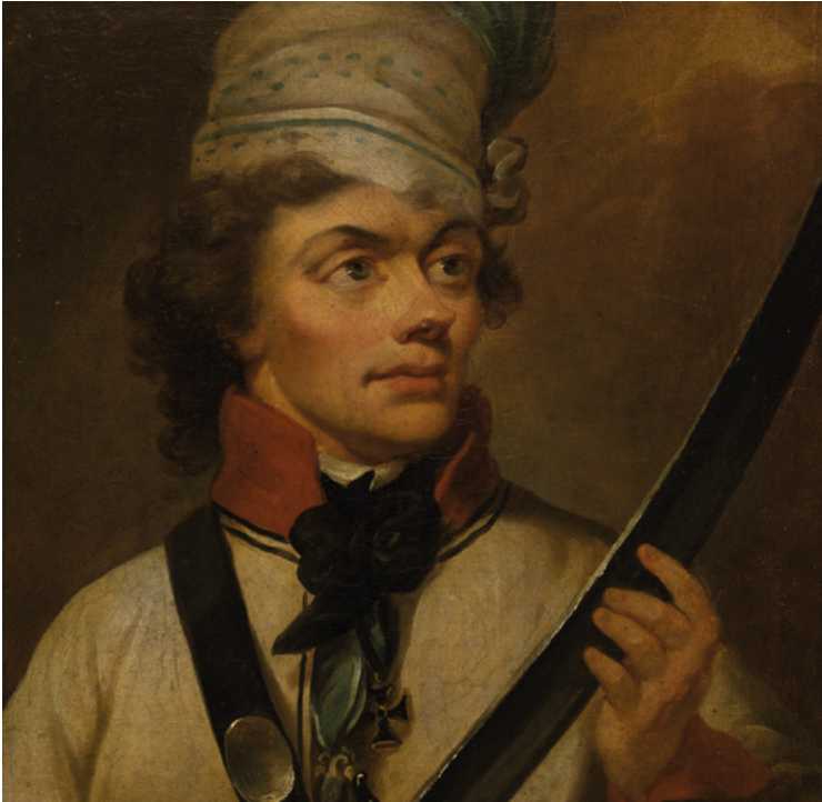
Portrait of Tadeusz Kościuszko, painted by Kazimierz Wojniakowski, 1794, Poznań Society for the Advancement of Arts and Sciences, National Museum in Poznań