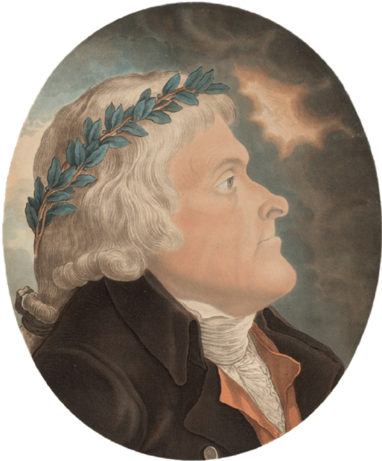
Portrait of Thomas Jefferson, after a drawing by Tadeusz Kościuszko, by Michał Sokolnicki, National Portrait Gallery in Washington

and failures, and his spirit was on many occasions put to a heavy test. In general, in extreme situation he behaved rationally, but sporadically he experienced nervous breakdowns. After the defeats of Szczekociny and Maciejowice, he even attempted suicide. Nonetheless, he was not