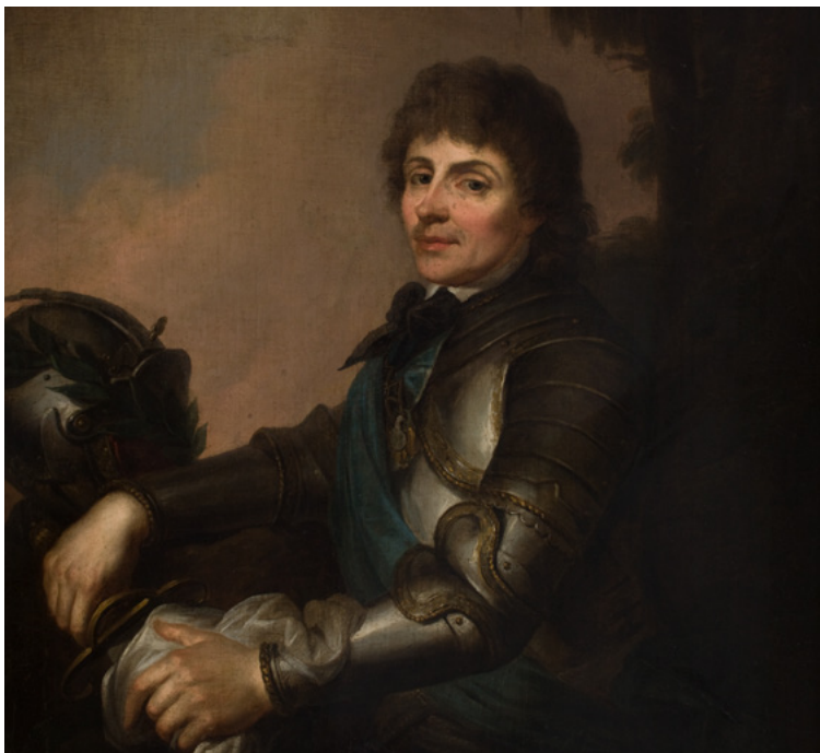
Portrait of Tadeusz Kościuszko in armour, unknown author, late 18th century, National Museum in Krakow

in the world. However, as a result of the armed intervention of Russian forces, the administrative and military reform of the Polish state was never implemented. In January 1793, Russia and Prussia conducted the Second Partition of Poland. An attempt to preserve state sovereignty was made in the form of an armed uprising led by General Kościuszko which began on 24 March 1794 in Kraków. The insurrectionists bravely fought for eight months with the superior Russian and Prussian forces. The uprising was crushed. The result of its failure was the Third Partition of Poland, conducted in 1795 by Russia, Austria, and Prussia, and the elimination of the Polish state from the map for the next 123 years.