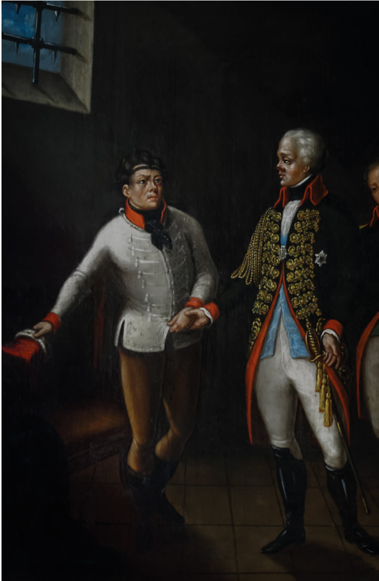
Freeing Tadeusz Kościuszko from Petropavlovsk Fortress 26 Oct 1796, Vilnius circle, 1st half of the 19th century, Kościuszko Mound Committee in Krakow