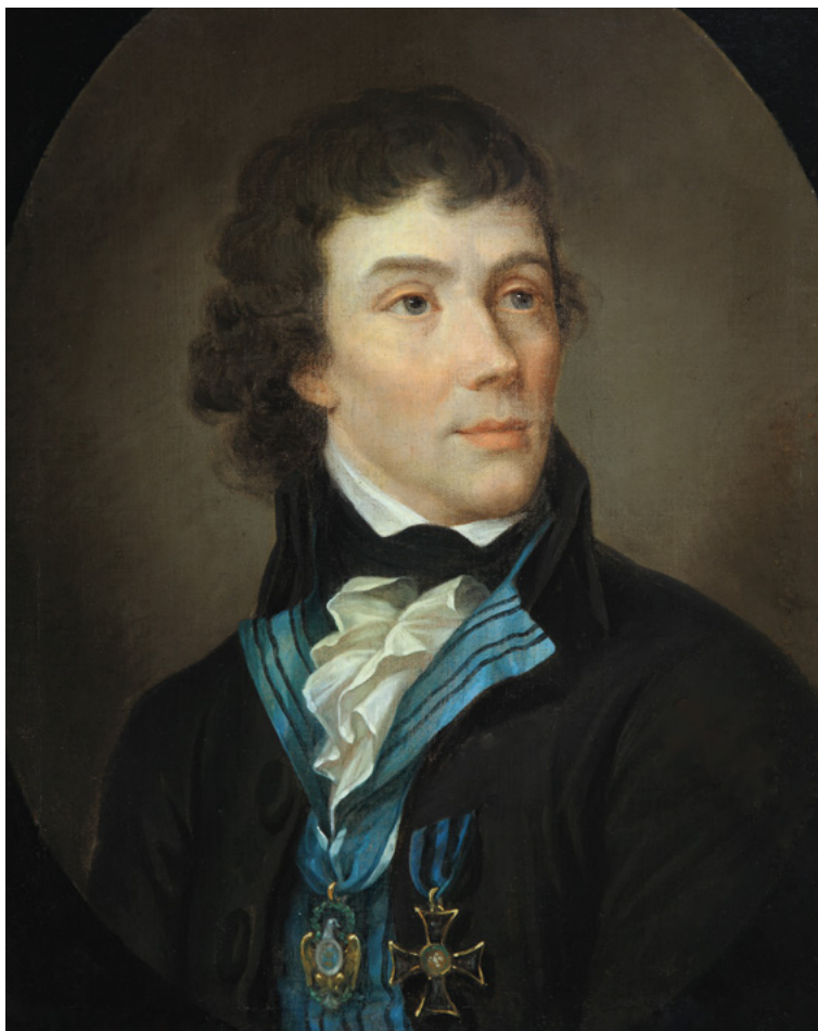
Portrait of Tadeusz Kościuszko, unknown author, ca. 1800, Polish Army Museum in Warsaw