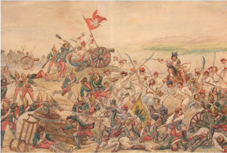
Battle of Raclawice, painted by Walery Eliaz Radzikowski, 1895, Museum of Krakow

as the Supreme Commander of the National Armed Forces. The Commander began intensive organisational operations to increase the size of the army and create an administrative structure. There were shortages of everything: officer and junior officer cadres, firearms and handheld weapons, uniforms, food, funding, and finally of recruits themselves. To compensate for the lack of firearms, the insurrectionists were armed with scythes and pikes. Kościuszko's main aim after taking command of the uprising was to expand the military operations to all parts of the country. First and foremost, he aimed to incite an insurrection in Warsaw. The commander realised that war against three partitioning powers at once was doomed to failure. He was counting on the hope that the war could be restricted to a confrontation with Russia alone, but unfortunately he was forced to conduct a war against the more numerous, well-trained and well-equipped Russian and Prussian armies. On 4 April 1794, he fought a battle at Raclawice against the Russians. In the assault led personally by the Commander, the kosynierzy , that is peasants armed with