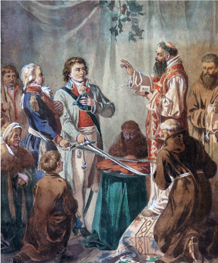
Scene of the blessing of the sabres of Tadeusz Kościuszko and General Józef Wodzicki, painted by Walery Eliaz Radzikowski, 2nd half of the 19th century, Museum of Krakow

general Iosif Igelström, was harsh and ruthless. In light of this, both in the country and in émigré communities, the dominant conviction turned toward the belief that the only chance to save the homeland was by inciting the nation to an armed uprising. On 24 March 1794, the insurrection broke out in Kraków, and Kościuszko was chosen