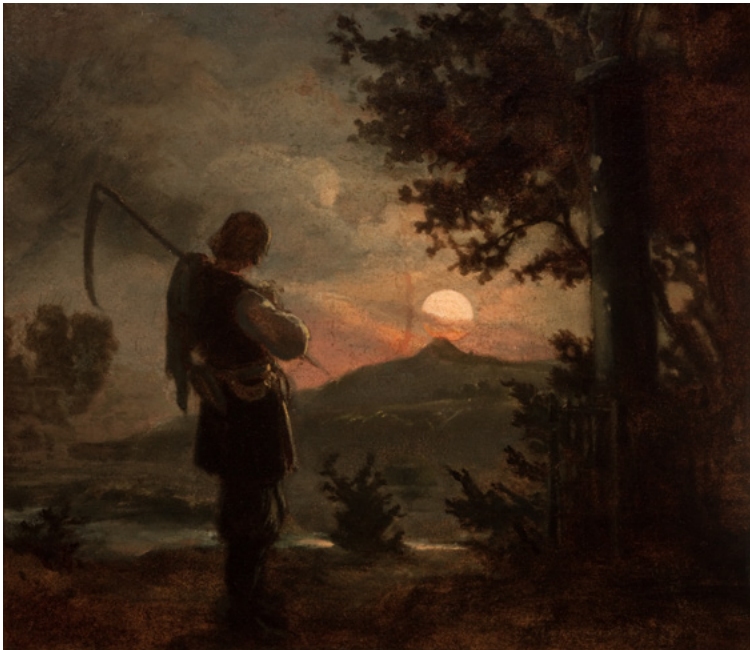
Scytheman, painted by Aleksander Kotsis, before 1862, National Museum in Krakow

Szyndler Bartłomiej , Tadeusz Kościuszko 1746 – 1817 , Warsaw 1991.