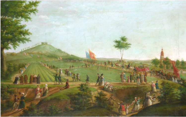
Procession to Kościuszko Mound in Kraków with Soil from the Raclawice Battlefield, painted by Teodor Baltazar Stachowicz, 1859, Museum of Krakow

period of autonomy in Galicia, when Kraków was the spiritual capital of a partitioned Poland, the site became the destination of national pilgrimages which aroused patriotic feelings and united Poles from all three partitions. In 2000, in the historic interiors of Bastion V of Fort no. 2 “Kościuszko” adjacent to Kościuszko Mound in Kraków, a modern, new permanent exhibition entitled “Kościuszko – A Hero for Our Times” was opened. The exhibition is narrative in nature, essentially comprising a story which draws on visitors’ knowledge, understanding and the senses by using artefacts as “actors” which pull the visitor into the universal world of a timeless hero. One of the aims of the exhibition is to illustrate the role that Kościuszko’s legacy can play in modern times.